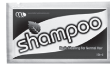
Code: 98949 Shampoo sachet. Supplied by Mulberry. 10ml