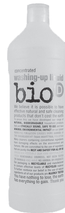
Code: M095774 Bio-D Nat Wash Up Lqd. 1L