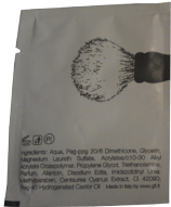
Code: 04397 Shaving cr me. Supplied by GFL. 10ml