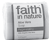
Code: M093375 Faith/Nat A/Vera Soap. 100g