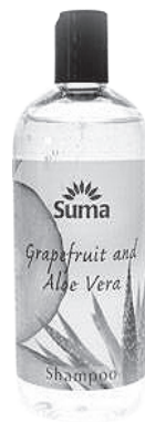
Code: M093406 Suma G/Fruit A/Vera Shamp. 500ml