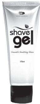
Code: 98965 Shaving gel. Supplied by Mulberry. 175ml