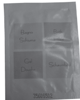
Code: 06784 Shower gel sachets. Supplied by GFL. 7ml