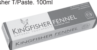
Code: M099904 K/fisher T/Paste. 100ml