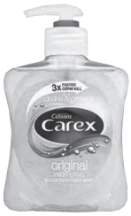
Code: 97366 Carex original antibac hand wash. Supplied by Jeyes. 250ml