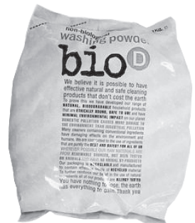
Code: M095775 Bio-D NonBio Wash Pdr. 2kg